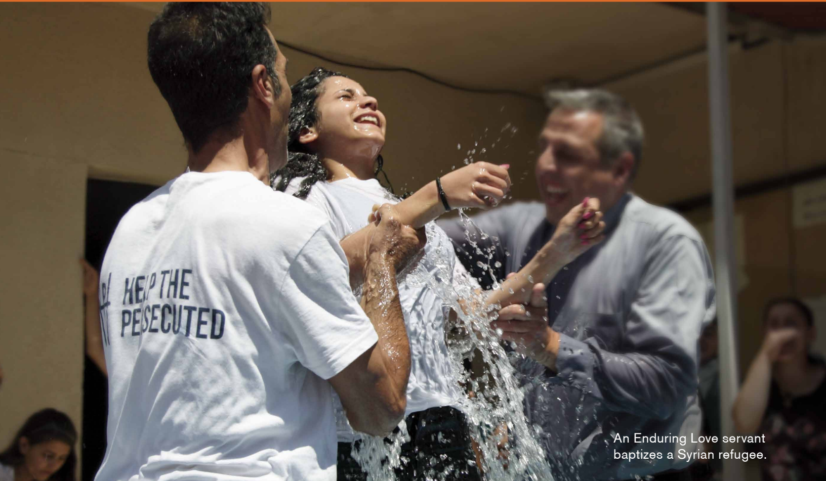
An Enduring Love servant baptizes a Syrian refugee.