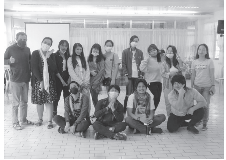
Our prayer retreat with the Missionaries in Training and two CWTP church planting teams.

Despite the lack of corporate worship and retreats for our missionaries, our church planting ministry continued in partnership with local churches. Because the church planting continued, we were able to recruit new workers as well. Our trainees went through twelve months of training (this was extended from seven months in a normal year due to the pandemic) where they spent two to three days a week in their assigned church planting ministry areas, and two to three days a week in the classroom learning more than seventy training topics related to the ministry. They were also able to attend a prayer retreat and attended our CWTP online worship twice a month. We are so proud of this group of trainees that endured the pandemic and completed their training!